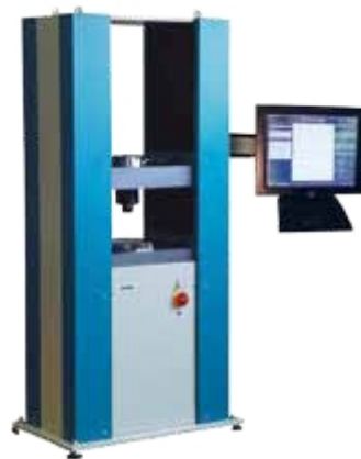
35-5100 万能实验机 200 千牛顿 Universal Testing Machine 200 kN