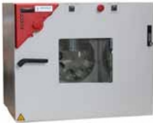
20-2572 旋转薄膜烘箱实验仪 RTFOT Rolling Thin Film Oven RTFOT