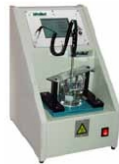
20-2200 自动球环实验仪 Automatic Ring and Ball Tester